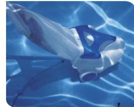
Cleans the Bottom