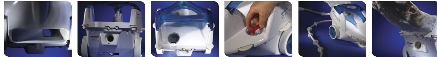
Wide cleaning path for fast clean

For use in ALL types of In-Ground Pools: Gunite, Vinyl Liner or Fiberglass.