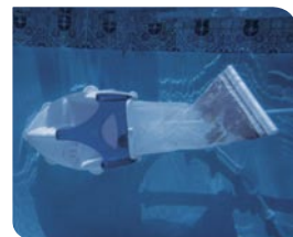
Cleans the Sides