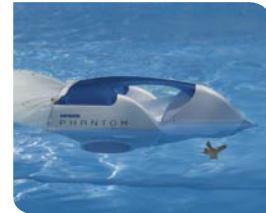
Skims the Surface

Introducing the Hayward® Phantom™, designed to totally clean the pool bottom, walls and stairs and systematically rise to skim debris from the top of the water.