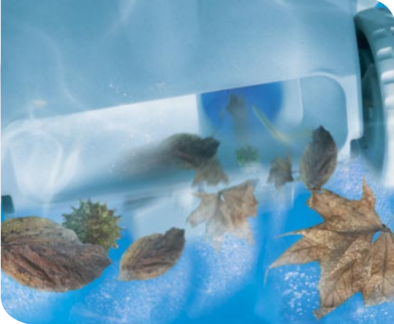
Dirt and debris are no match for the wrath of Viper's cleaning path, which is 41% wider than its closest competitor.

Dirt has nowhere to hide. From sand to the most tenacious twig. Viper cleans debris quickly. Meticulously, conveniently. With the widest cleaning path available – 41% wider than the closest competitor – you clean your pool even faster. Within 3 hours for the average pool. And since Viper sports the largest debris bag (6 quarts), you empty less often. You get crystal-clear water practically on demand.