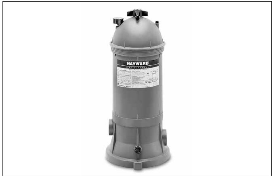
C900 StarClear Plus Filter

*Determined by pump size and piping system hydraulics. 2" piping is recommended for flow rates above 90 GPM. Refer to "Friction Loss" in Hydraulics section, pages 26–29.